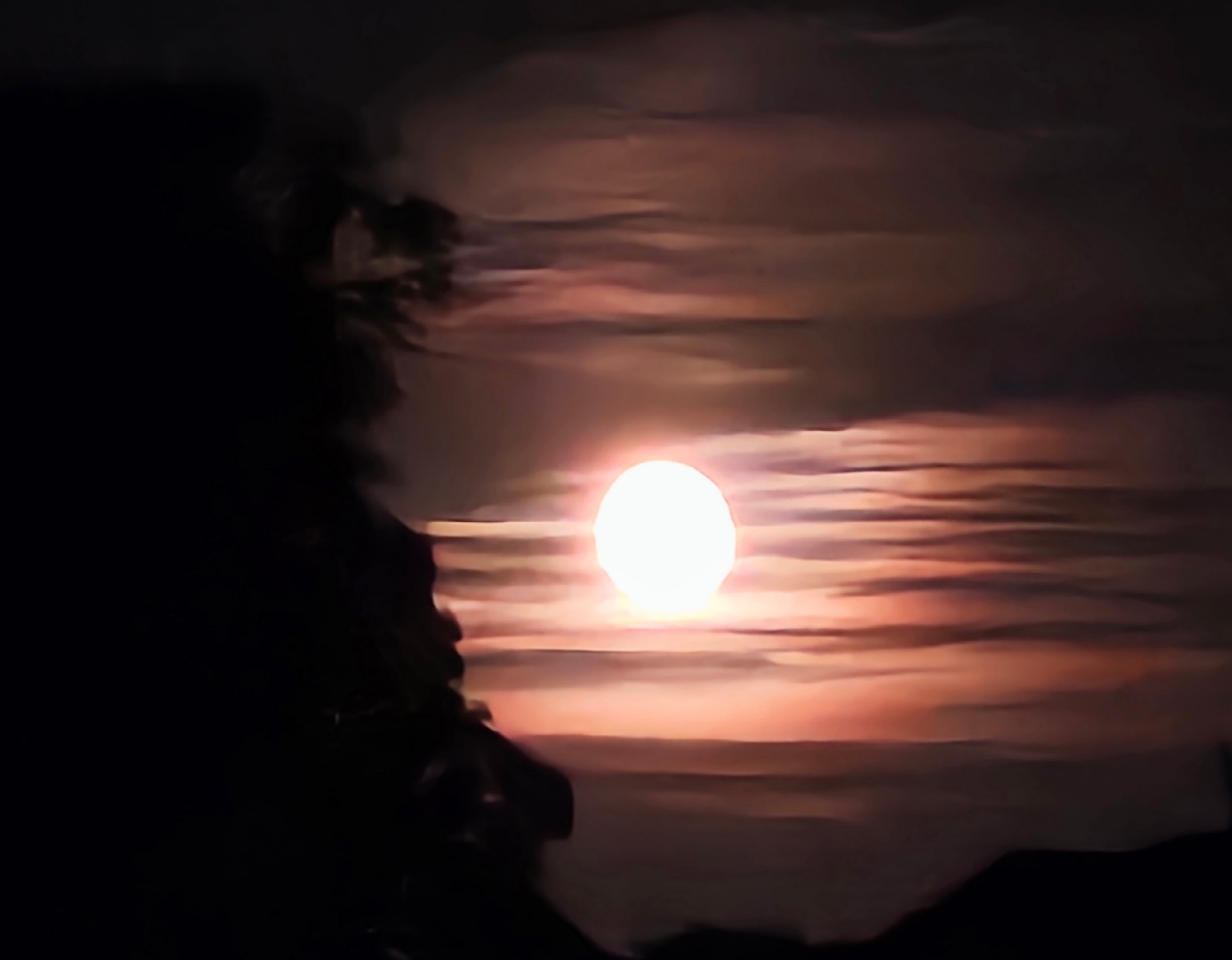
The Strawberry Moon over Strawberry Hill